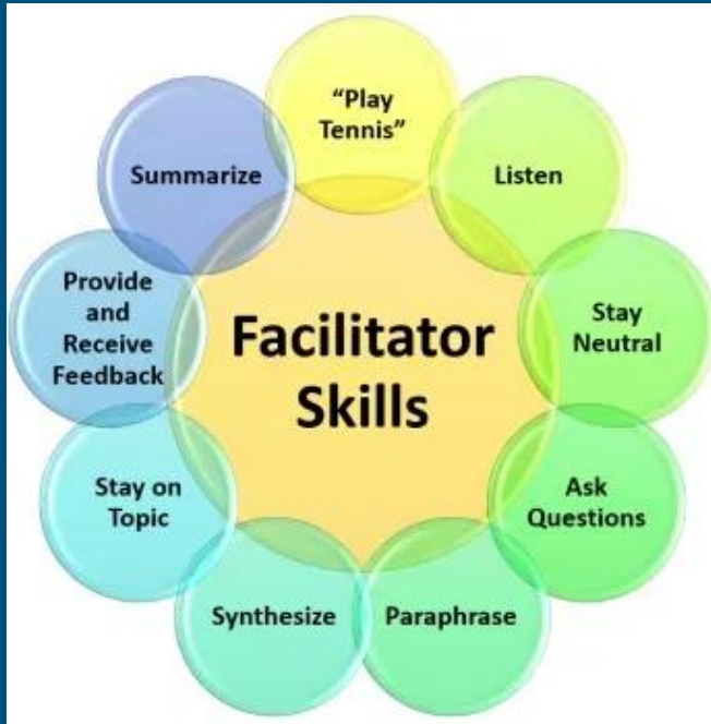
Table Top Exercises